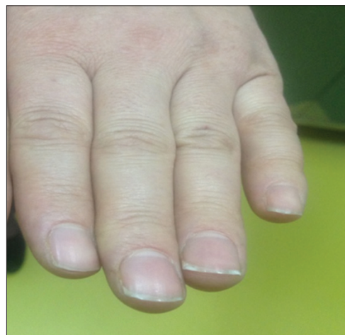
Figure 2: Normal nail plates after treatment