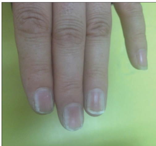
Figure 1: Bilateral longitudinal leukonychia affecting several nail plates

We suggest that in cases of acquired bilateral true leukonychia, environmental factors such as unprotected exposure to chemical substances need to be considered. Moreover, if there is a zinc deficiency, it needs to be treated to ensure better response to the treatment of leukonychia.