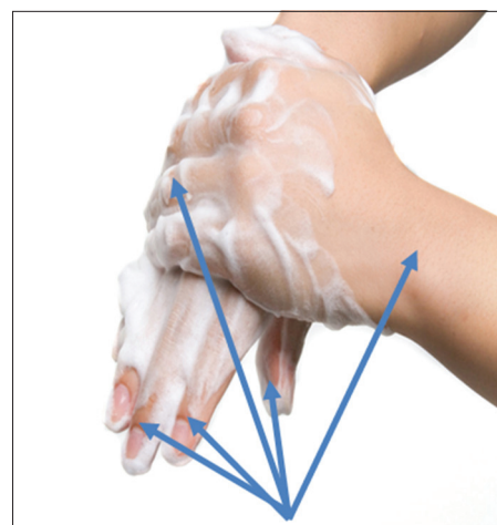
Figure 3: How to rubbing the hands with detergent solution have shown. The blue flashes have shown the areas of hands that randomly have not affected with detergent. However, it must be careful that the detergent solution accuracy and uniformly distribute during hand washing. As the infection has left in the area showed and after the hands washing the remained contamination will quickly spread to another hands area

Contact with the saliva causing severe contamination of hands, which could transfer it to objects or patients. Oral microflora (microbiome) has containing more than 450 bacterial species some of which are potentially pathogen. The most common bacteria living in the mouth are Staphylococcus aureus , Staphylococcus epidermidis ,