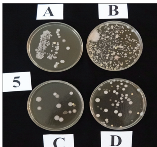
Figure 2: The results of bacteriological assay of subject five fingers sampling in the operating room is shown. Plate A: Culture of fingerprint before hand washing. Plate B: The bacterial culture results of the brain heart infusion broth extract of hand washing before hands scrubs. Plate D: The bacterial culture results of the brain heart infusion broth extract of hand washing after hands scrubs. Plate C: The results of fingerprinting after hand scrub. The differences of the colonies number on plate A, B, D, and C should have considered

As shown in Figure 4, several areas of hands clearly not affected during washing as often as missed areas should be considered. The research results indicated that hands washing with carelessness and impatience to carry out in these areas would increase the level.