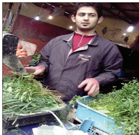
Figure 7: After refund, extra money all would be contaminants. Due to the fact, the products are from the farms that have been feed by animal manure. Therefore, varieties of fecal bacteria are as infecting agents. The manner in which these contaminations are transferred to community health centers