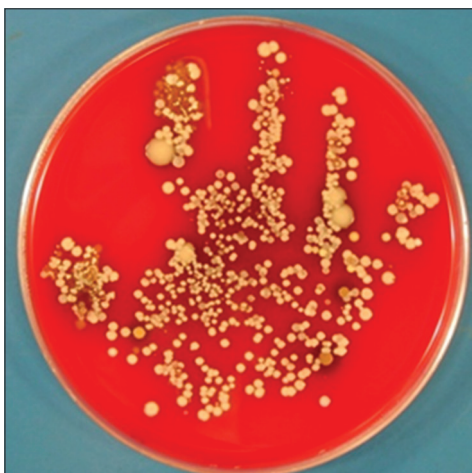
Figure 6: Place the palm of the hand on blood agar medium and incubated for 24 h in 37°C is shown. As can be seen, many bacteria have released on to the surface of bacterial culture media. It should have noted that few of the bacteria cause blood \alpha or \beta hemolysis may be pathogen

meet a hospitalized patients or even meet one of the health worker with hands and kissing will causes of the transferring the bacterial contaminations. All the hands touch money of this seller have been contaminated with fecal bacteria. [59] Due to the facing of the organism with different physicochemical agents; then, they may have acquired resistance and the cross-resistance in the face of antibiotic is released. Moreover, these entire organisms can transfer into the nurse's hands or even the patients and different objects. However, the bacteria can entrance into the hospital environment, by in causes of transient bacterial flora of different areas and has been spread and or colonization in different instrument surfaces of the hospitals. One of the most important hospital areas is ICUs which may be settle down by immunocompromised patient's hospitalized for a long time and are exposed to the potential virulence factors.