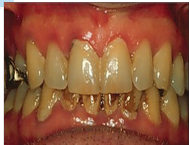
Figure 5: Inflammation and infection of the gum, as well as anterior teeth decay, are seen. Most people with mouth infection, pharyngitis, and tonsillitis are the sources of trans-infections. In addition, low level of oral cavity health condition is the important sources of hands contamination and transfer the infectious agent to others. Traditionally, some people are habiting to use toothpicks, in this way possibility of hands contamination taken place